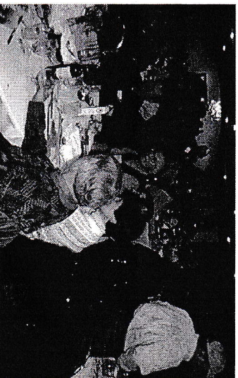
What a great crowd—same time next year...