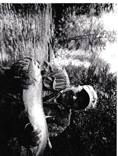
"I can't believe I get paid for this!"