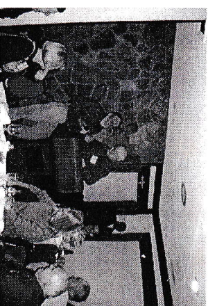
Happy Birthday Tom!