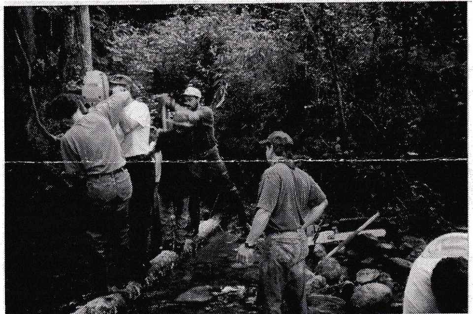
Work projects are fun.....really!!!!

The Georgia TU Council's workday will be on Saturday, February 15, 9am, at Smithgall Woods Conservation Area. Fellow TU'ers should be milling around the parking lot near the Visitor Center. All you need to bring is your enthusiasm and your waders; lunch will be provided. Plan to get wet - we'll be installing some structures and enjoying each others company!!