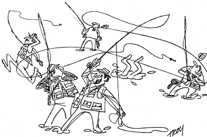
You would never know it, but I haven't used a fly rod in years.

NOTE: As you have hopefully noted we have a busy spring, summer and fall ahead and some of these people will need our help in carrying out their responsibilities. Kyle Burrell will need lots of assistance with "Trout Day" at the state park; Jim Nixon needs help with campouts; and so on. If you see an assignment you can help with, please call and offer your assistance - or if you are called, lend a hand.