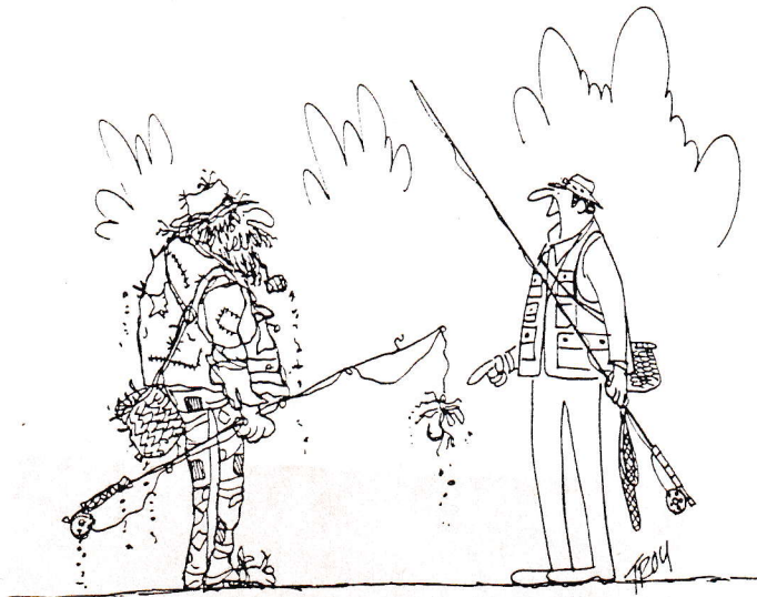
Tie your own flies?

SEE YOU AT THE MEETING ON THE 17TH, ON CHARLIE'S CREEK ON THE 22ND AND AT DOUBLE BIT ON THE 27TH