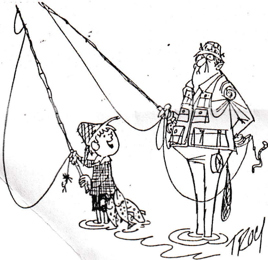
I caught them on a size twelve Dark Hendrickson dry fly. What are you using?