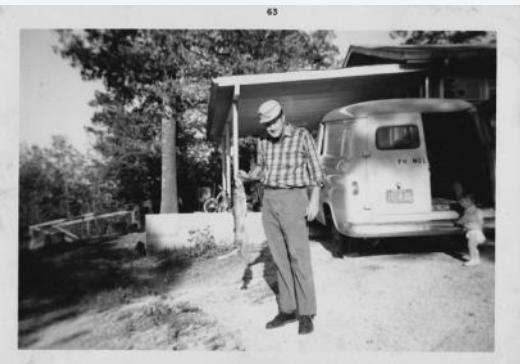
Yes, that's me in the background!