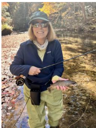
My first trout after surgery

So what are YOU waiting for? Get out there and start your own fishing streak!