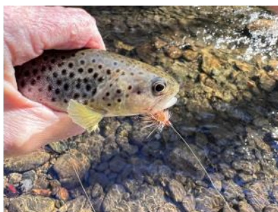
Orange stimulator does it again