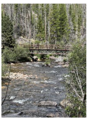
Many Rabunites will recognize this bridge!