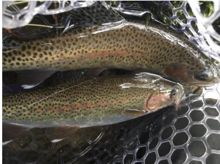
The results—a double helping of wild rainbows!