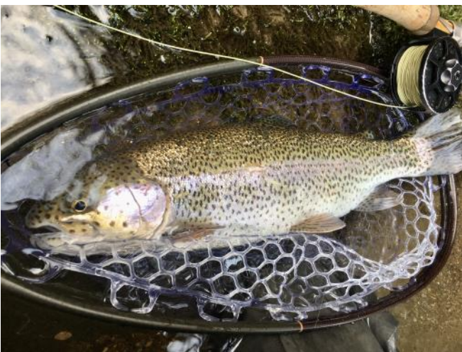
Switched to a #18 Prince for more flash. Got a 18” stocker rainbow on 6x tippet!