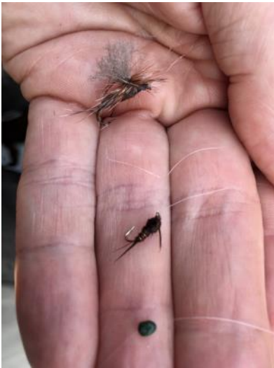
A Parachute Adams and Prince nymph as a dropper

From the Nantahala River, Delayed Harvest section: