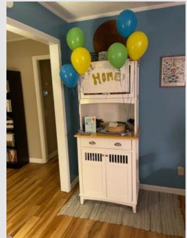
This was the table set up for folks to leave their meals.