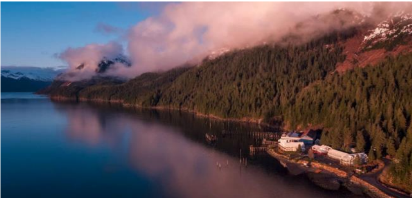
Orca Adventure Lodge

And for the record, we did manage to bring our limit of silver salmon to hand each day. We even topped the fish boxes off with some halibut which was an unexpected bonus.