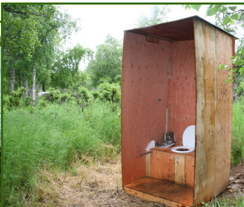
Potty at one location. Care to guess why there is no door?