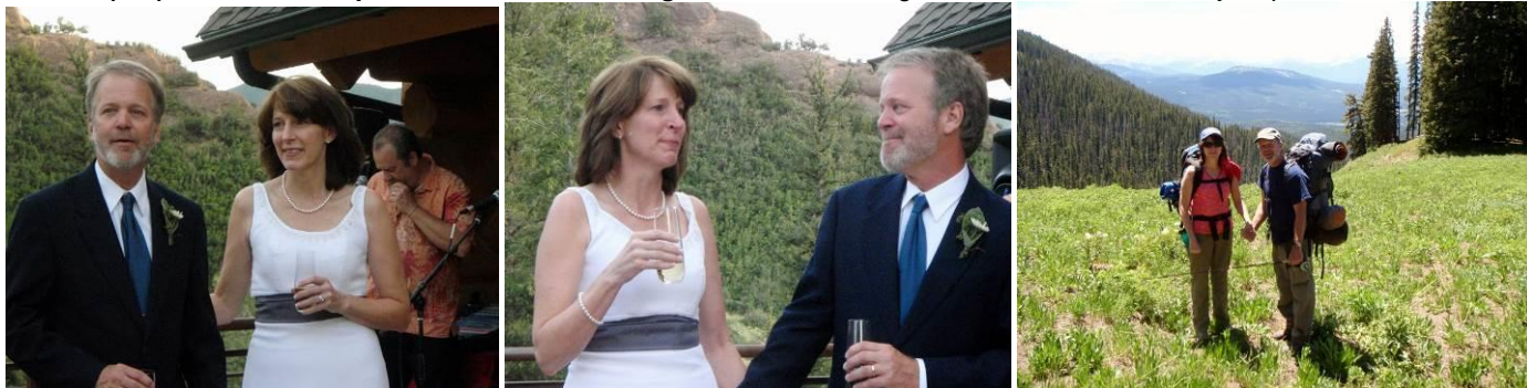
The newlyweds at their wedding reception and starting their Rocky Mountain High backpacking honeymoon.

July 9 (Tues) Chattooga River Electro Sampling CANCELLED due to very high water level.