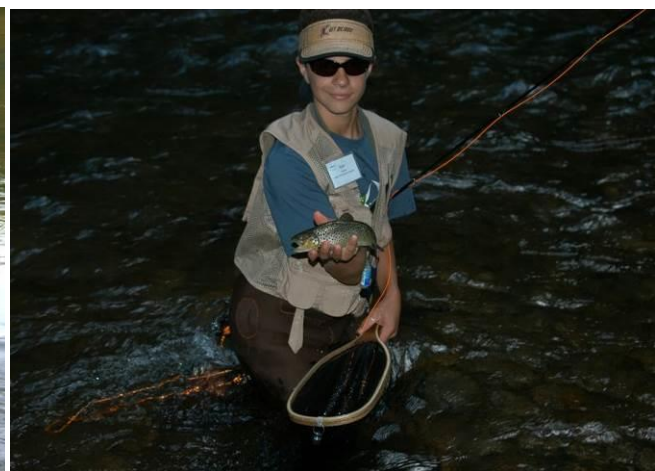
The above Trout Camp 2013 photos