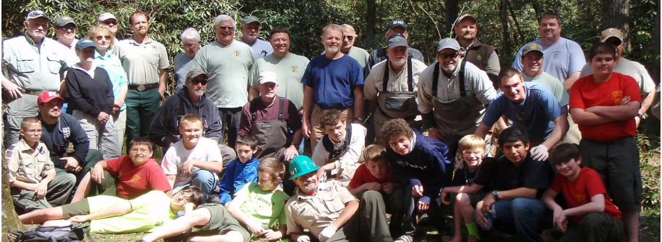
Volunteers - TU: Rabun=8, Foothills=6, Savannah=9, NGTO=1, Scout troops: #5=1, #6=14, #40=1, USFS = 3 & GADNR=1