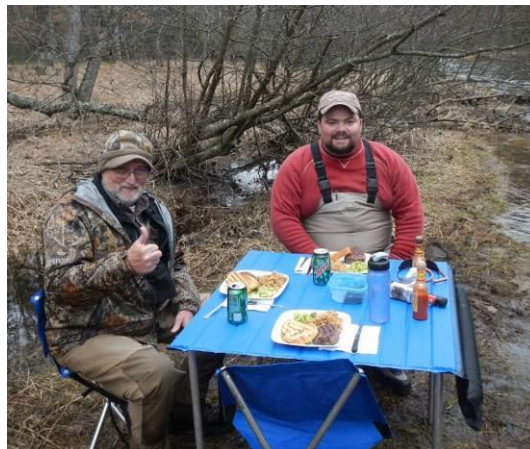
Our Shore Lunch was GOOD!