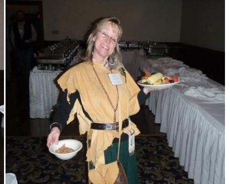
Then there is the Famous Dillard House Buffet