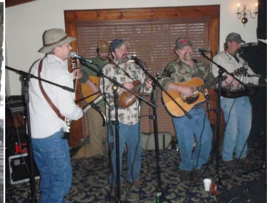
Finger Lickin' Good Bar-B-Que with live Bluegrass – It Don't Get Much Better Than That