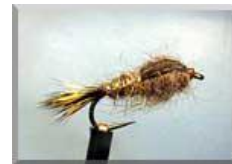
GOLD RIB HARES EAR

THIS FLY WILL REPRESENT THE MARCH BROWN MAYFLY. POUNDING THE BOTTOM WITH THIS PATTERN CAN PROVIDE CONSTANCE ACTION FROM MID-MORNING INTO THE EARLY STAGES OF THE HATCH. HOWEVER NYMPAL COLOR TENDS TO ADAPT TO THE COLOR OF THE STREAM BED. DURING FEBUARY, MARCH AND EARLY APRIL HAVE SOME OF THESE TIED UP FROM A LIGHT BROWN TO ALMOST BLACK.