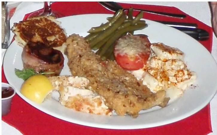
Typical serving with 3 entrees.