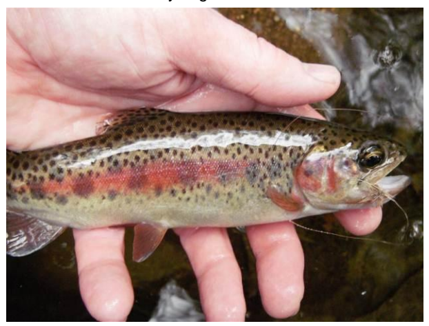
Two lessons were reinforced during the farewell tour: