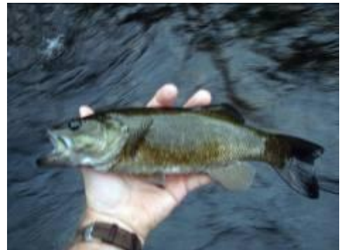
The other day on the Little T. - a tremendous lightning storm blew in on me and I had to cut the trip short. Before the storm I got two rock bass, about a pound each, on a white Woolly Boogier stripped fast through the deeps runs. On the way out I passed a house fire in Cowee - I bet it got struck by lightning. Report submitted by Pat Hopton