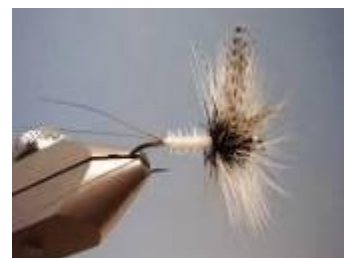
EASTERN GREEN DRAKE SPINNER

IT'S THE MAGIC MONTH. DON'T GO TO "THE RIVER" WITHOUT THESE IN YOUR FLYBOX ..... AND STAY UNTIL DARK-THIRTY!