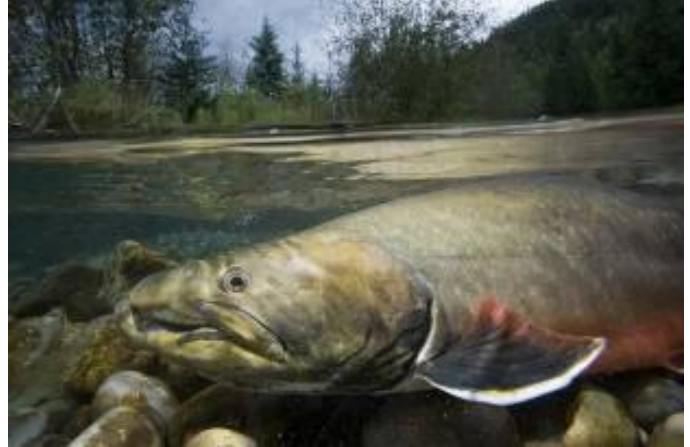
A picture of the threatened bull trout, a fish that is part of a habitat conservation program by the U.S. Fish and Wildlife Service.

Aquatic conservation a strong investment in jobs, economy by Marie Yeung Epoch Times Staff (11/6/2011)