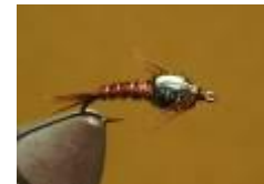
FLASHBACK PHEASANT TAIL

WELL THE HOLIDAYS ARE BEHIND US NOW AND IT'S TIME TO HIT THE RIVER AND LOOSE SOME OF THE WEIGHT WE GAINED. THIS IS A GREAT FLY TO DROP OFF A DRY OR STRIKE INDICATOR. JUST GET IT DOWN TO WHERE THE FISH ARE. SEE YOU ON THE RIVER