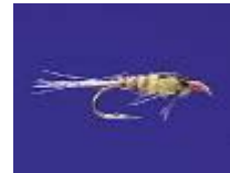
BLUE WING OLIVE NYMPH

THIS FLY CAN BE TIED IN A VARIETY OF COLORS. THIS IS A GOOD FLY TO HAVE BECAUSE TROUT ARE MOVING UP IN THE WATER COLUMN PRIOR TO A HATCH. WE SAW THIS ON OUR LAST CAMPOUT. TIE THIS FLY AS YOU WOULD A GOLD RIB HARE'S EAR. JUST SUBSTITUTE THE DUBBING WITH OLIVE. DROP IT BEHIND A DRY FLY OR STRIKE INDICATOR AND DEAD DRIFT. THAT'S THE TICKET TO MORE HITS ON THIS FLY DURING THE WINTER MONTHS. A MUST AFTER THE FISH ON THE D.H. GET SMARTER.