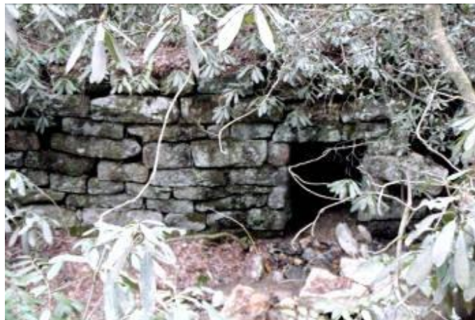
Stone Culvert for Dick's Creek beside the Sandy Ford Road

Construction began in 1854. Massive stone piers and culverts were constructed in Rabun County , as the railroad investors built for the ages with seemingly unlimited capital. No rickety wooden trusses for the Blue Ridge! The incredible Stumphouse Tunnel near Walhalla (closed to visitor entry in recent years) remains as a monument to their vision, as well as other works such as the Dick's Creek tunnel in Rabun County . All this work was done entirely by human labor using hand tools and a few draft animals.