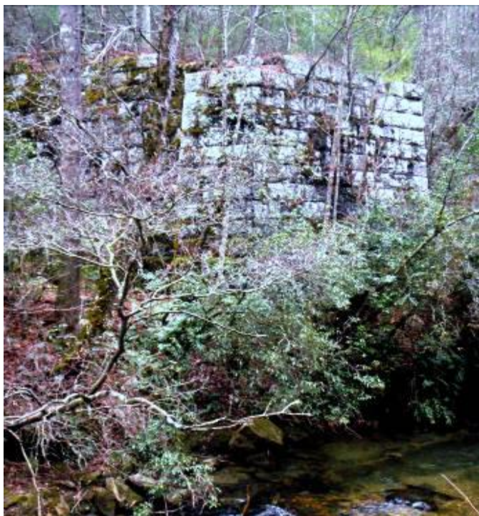
Bridge Abutment for the Crossing of Warwoman Creeel

The construction of the Fontana Dam, and the resultant flooding of much of the Little Tennessee Valley in the 1940s, decisively ended any lingering possibility of realizing the ambitious project proposed over a century earlier.