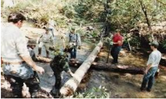
Working to enhance the habitat in a wild trout tributary

have since logged over 100 in-stream work outings throughout Northeast Georgia, always under the guidance and supervision of agency professionals.