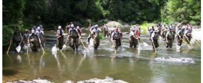
Professional & Volunteers Electro-Sampling THE RIVER

The professionals came to Ford Mountain on February 28, 1986. The professionals listened as the "city" TU folks described the decline in the fishery and their suggested solutions involving "catch & release" and "fly fishing only" regulations. The professional proposed an action plan that included a 3-year study to collect data scientifically on water quality, the fishery, angler use patterns and angler experiences. It was the beginning of the Chattooga Coalition. (To read more about the Chattooga Coalition, click http://rabuntu.org/site/about/work-projects/the-story-of-the-chattooga-coalition/ .)