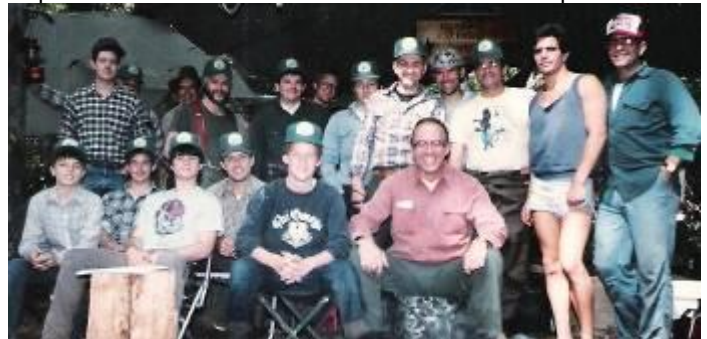
Klondikers at an Annual May Campout

In May 1986, the Klondikers held their annual 5-day campout at THE RIVER. At that campout they discussed how the organized "city" TU members were trying to sway the professionals in the future management of THE RIVER. The "locals" needed to also organize so that they could express their views and to "give something back" to the coldwater resources that have meant so much to them. The Klondikers voted to request a charter from National TU for a Rabun Chapter.