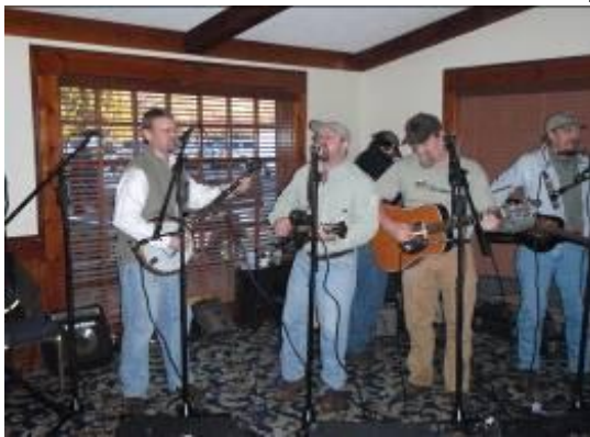
The Foxfire Boys

The festivities began in the afternoon with a bar-b-qued pig pickin', bluegrass music by The Foxfire Boys (all are members of Trout Unlimited). There were snack trays of cheeses, crackers, veggies with dips, and fruits. Soft drinks and ice were also available. Rabun trout fishing videos were shown on a large screen TV and outside was a trout fishing guide's drift boat and a full size Indian teepee for kids of all ages to enjoy.