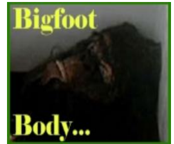
Yep, it was all a big hoax.