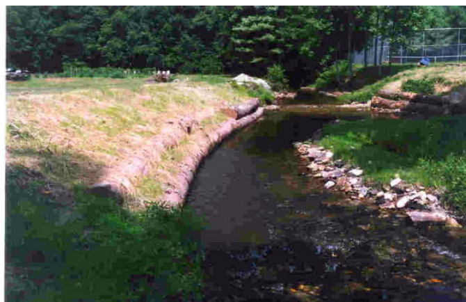
Suches Creek behind Woody Gap School – before & after

If you are aware of a section of public stream in need of restoration or enhancement, please report it to the local USFS office or tell us here at TIGHT LINES. If you know a private owner that wants some help with stream restoration or enhancement, put him in touch with: