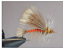
October Caddis Fly Orange Stimulator

HEAD: YELLOW DUBBING WITH PALMERED GRIZZLY HACKLE