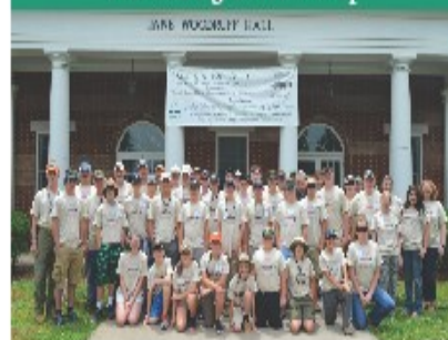
Picture of success with learning the sport, having loads of fun, camaraderie, and individual growth.

Applications will be taken up to April 15, 2015. Contact Charlie Breithaupt. His info located at bottom of flyer above.