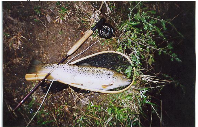
A Chattooga DH 20 inch brown trout that took a size 16 deer hair caddis on March 15, 2005.

be on the Chattooga DH in the afternoons casting to feeding trout. In March those big brown trout in the Chattooga DH will finally start hitting dry flies.