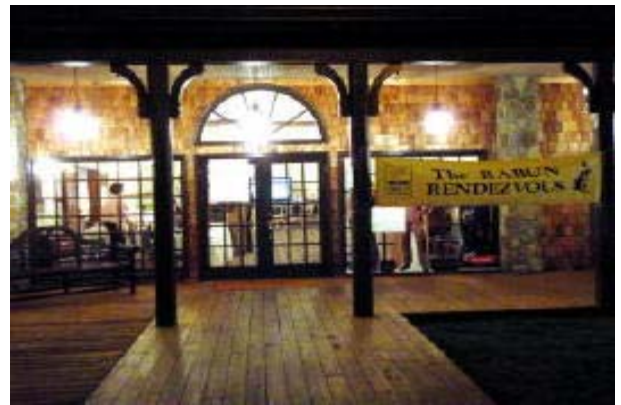
Some Of The Silent Auction Items – Carolyn Kidd With Knit Cap & Fingerless Gloves in Bucket Raffle - Lobby Empties At Mealtime