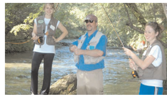
Fishing on the Stream