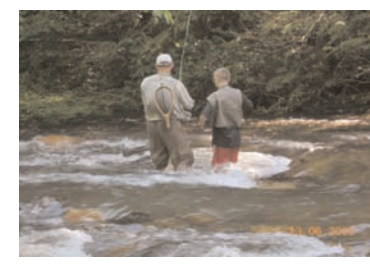
Fishing Fast Water... Have Your Mentor Close By