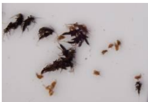
GA WRD conducted stomach contents sampling on trout in the Chattahoochee River, January 13, 2012.