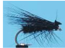
BLACK ELK- HAIR CADDIS

THIS TIME OF THE YEAR, EVERYBODY SHOULD HAVE ALL THEIR FLY BOXES FULL. IF YOU HAVE FORGOTTEN THIS ONE, TIE A FEW ALONG WITH SOME BLACK STONE FLY NYMPHS. DROP THE NYMPH BEHIND THIS CADDIS. JUST MAYBE YOU WILL KEEP WARM WITH A FEW HOOK-UPS. SEE Y'ALL ON THE RIVER.